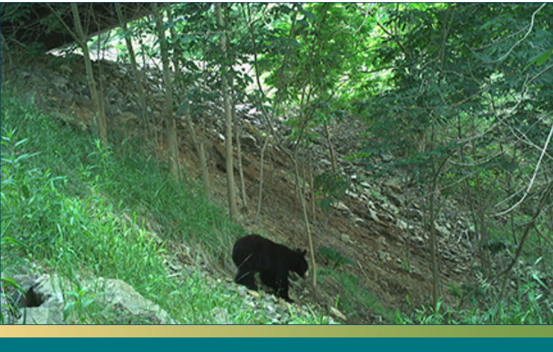
BEAR CROSSING UNDER I-26 AT BIG LAUREL CREEK BRIDGE (NCWRC)

effectiveness of reducing WVC along I-26.