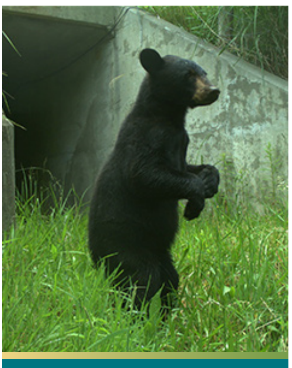
BEAR CROSSING UNDER I-26 (NPCA)