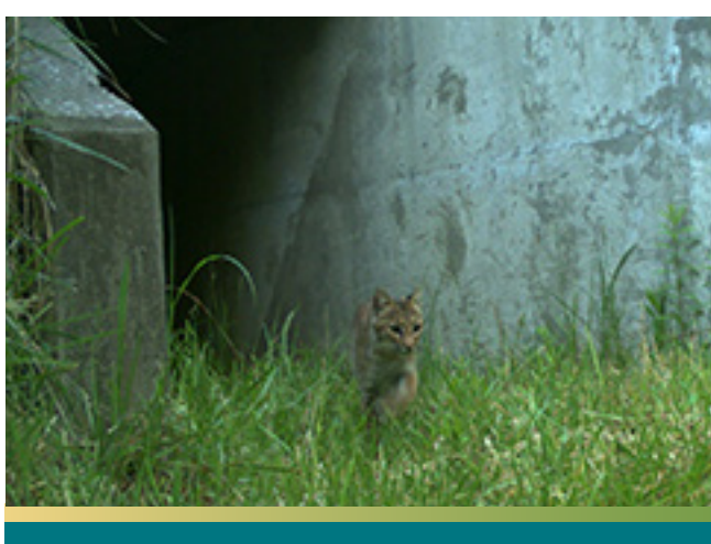
BOBCAT CROSSING UNDER I-26 (NPCA)

The project contributes to the Terrestrial and Aquatic Habitat Connectivity criterion by installing improved fencing to direct species to the existing crossings. This section of the I-26 corridor offers prime wildlife habitat. The surrounding landscape is primarily forested with mountainous terrain. Without wildlife fencing and despite the concrete barrier, black bear regularly access and attempt to cross the I-26 project corridor. While larger animal species such as the black bear and deer were the target species for the wildlife crossings, they benefit a range of species. Improved usage by mammals of all types can be expected. Mammals in the project area have large ranges extending from tens to hundreds of acres in the case of larger mammals. While area reptiles generally have smaller habitat ranges, they access different parts of the I-26 area through the year.